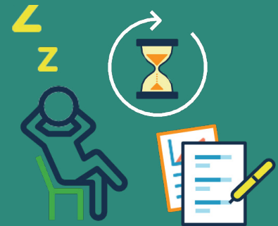
Return to Work, Sleep or Play