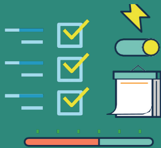
Set Up Activation