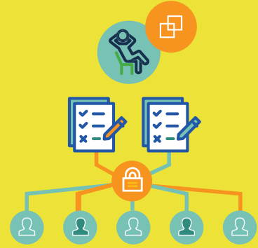
Empower Clients Securely