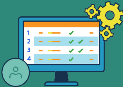
Define Workflow Steps